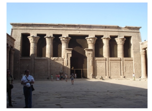
Fig. 2. The courtyard and hypostyle hall, where festival performances took place.

performative has more than one definition and various forms of usage. In the theatre, performativity might indicate the capacity for dramatic performance or verbal expression in a piece of literature, a speech, a folktale, or a sacred rite. In the field of performance studies, the word is directly related to speech act theory as introduced by philosopher J. L. Austin, such as the "performative utterance" that is a "perlocutionary act" (Austin 1975, 94-108), and its sociological applications. This use of performativity is more commonly seen in Egyptology and related disciplines. However, Egyptologist Robyn Gillam points out that