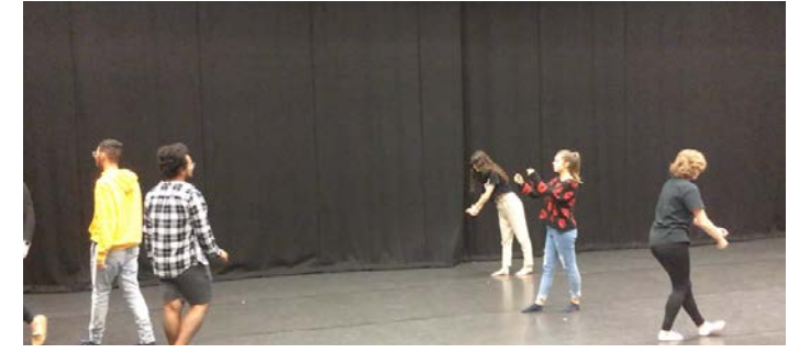
Fig. 7. Actors use the script of gestures to locate their characters' movements in rehearsal.

I encouraged them to consider the stylistic differences between classical Greek art and ancient Egyptian art and the cultural differences reflected, particularly in stance and gesture as depicted in sculpture. Greek poses are often relaxed, gestures fluid, lines soft and asymmetrical.