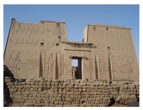
Fig. 1. The great pylon at the entrance to the Temple of Horus in Edfu.

customs to appease the native Egyptian as well as the increasingly hegemonic Greek population (Lloyd 2000, 401-402). Therefore, it is quite easy to argue that The Triumph of Horus owes its dramatic nature and theatrical qualities to a classical Greek influence. But it would be wrong to make that assumption. While certain aspects of the play might reflect Greek theatrical tradition, such as the inclusion of a chorus, the similarities end there. Its