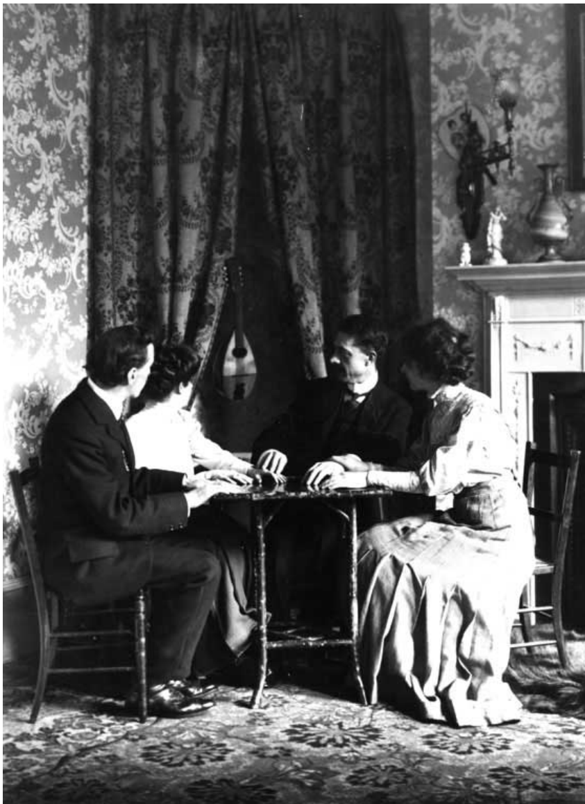
Figure 7 A séance in progress, showing women in typical daywear.

same conclusions: that these women were representatives of morality and that their participation in their chosen spheres of entertainment imbued those spheres with propriety for their audiences. Photographs of spirit mediums depict a number of tropes that denoted visible means of identifying true women. Images of spirit mediums from the 1910s and 20s show women in conservative, often white, dresses, with their hair up. They wear clearly corseted dresses; many spirit appearances tried to convince séance sitters of their authenticity by letting the sitters feel their hips, proving that the spirits were not wearing corsets and thus could not be the same entity as the medium. They wear no apparent makeup and, in an attempt to emphasize their youth and innocence, frequently wear large bows redolent of the nursery in their hair or on their clothes. Some mediums went barefoot, ostensibly to show that they had nothing hidden in their shoes, but in many cases really in order to untie knots or open locks when they were bound up prior to a séance.