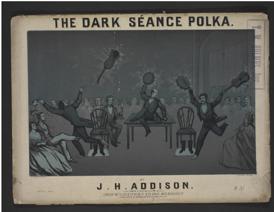
Figure 1. The Dark Séance Polka was published for piano in the late 19 th century to represent the sounds of the séance.