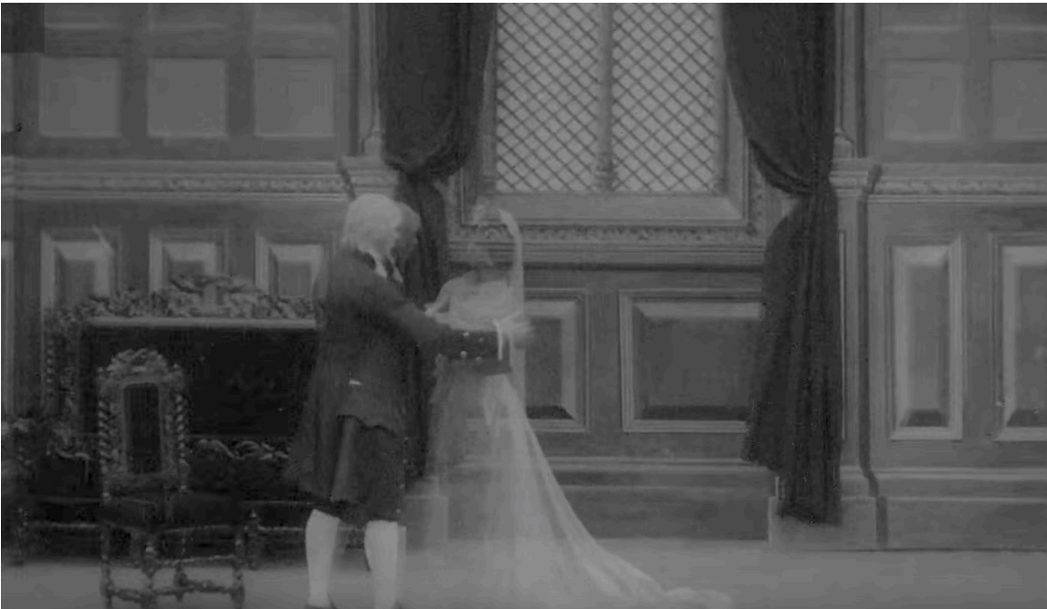
Figure 2: The ghost of a woman appears in The Mistletoe Bough (1904) to help her husband locate her body. Watch: https://www.youtube.com/watch?v=lo1HkQ2hNA8