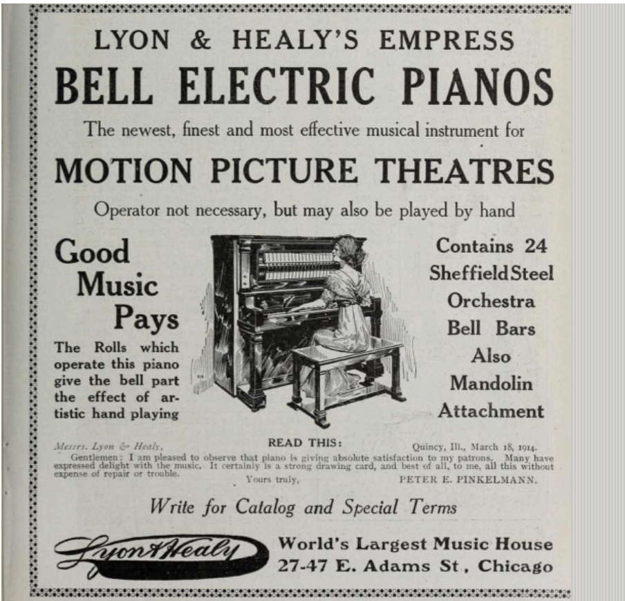
Figures 8a and 8b. The image of a woman in conservative dress with her hair up became a trope in depicting silent film accompanists.