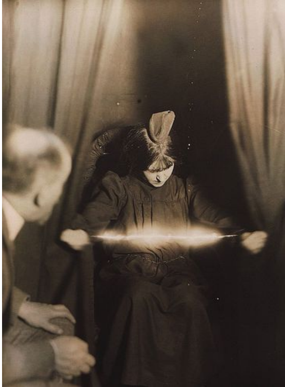
Figure 5. A medium controls electricity during a séance.