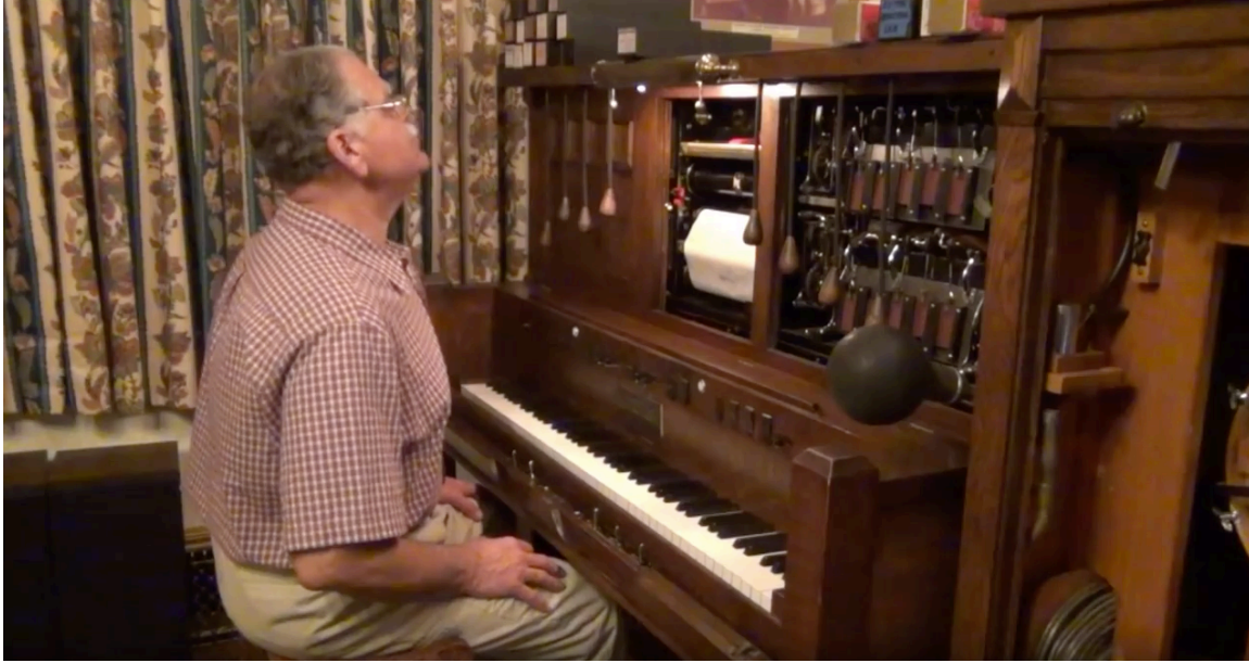
Figure 6. The American Fotoplayer in action, playing “Ghost Parade” by John Scott. Watch: https://www.youtube.com/watch?v=SF4BWIIUEOQ

Audiences for the movies were enormous, and managers and owners responded by increasing their use of technology throughout their theaters. Organists playing enormous Wurlitzer organs rose from the floor on hydraulic lifts; performers using the Fotoplayer or similar instruments had interludes between reels of film or between films in which they gave featured solos for the audience; and photoplayers used a mix of pre-recorded sounds with live playing to create a mosaic of music and effects, all carefully selected to match the movement and emotion on the screen.