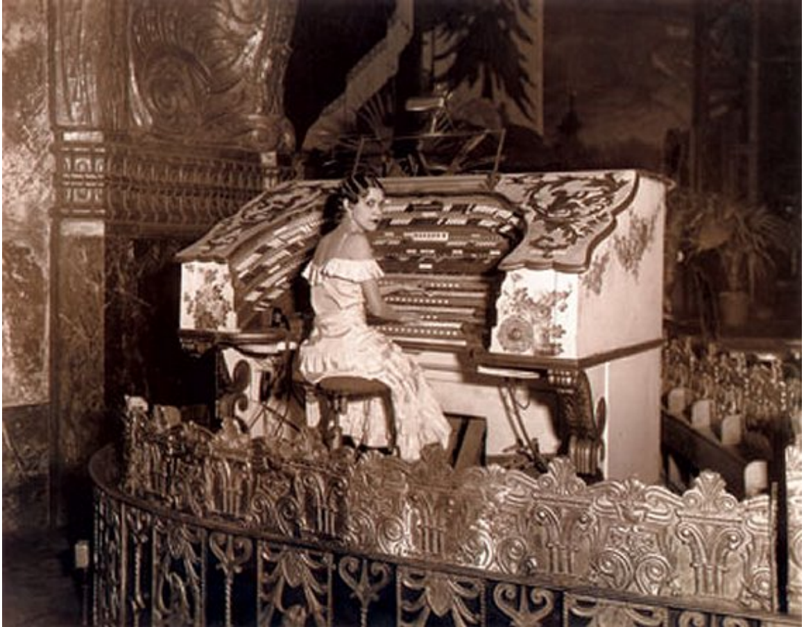
Figure 9. Photoplayer Rosa Rio became famous for her original accompaniments for film.

Period articles, directories, advertisements, and testimonials about and of female photoplayers include information on their church or synagogue memberships, jobs, or activities, signifying their piety. The criteria used to judge women is epitomized in this short article from The American Organist from September, 1918, that lists the subject's church and civic activities and her good taste: