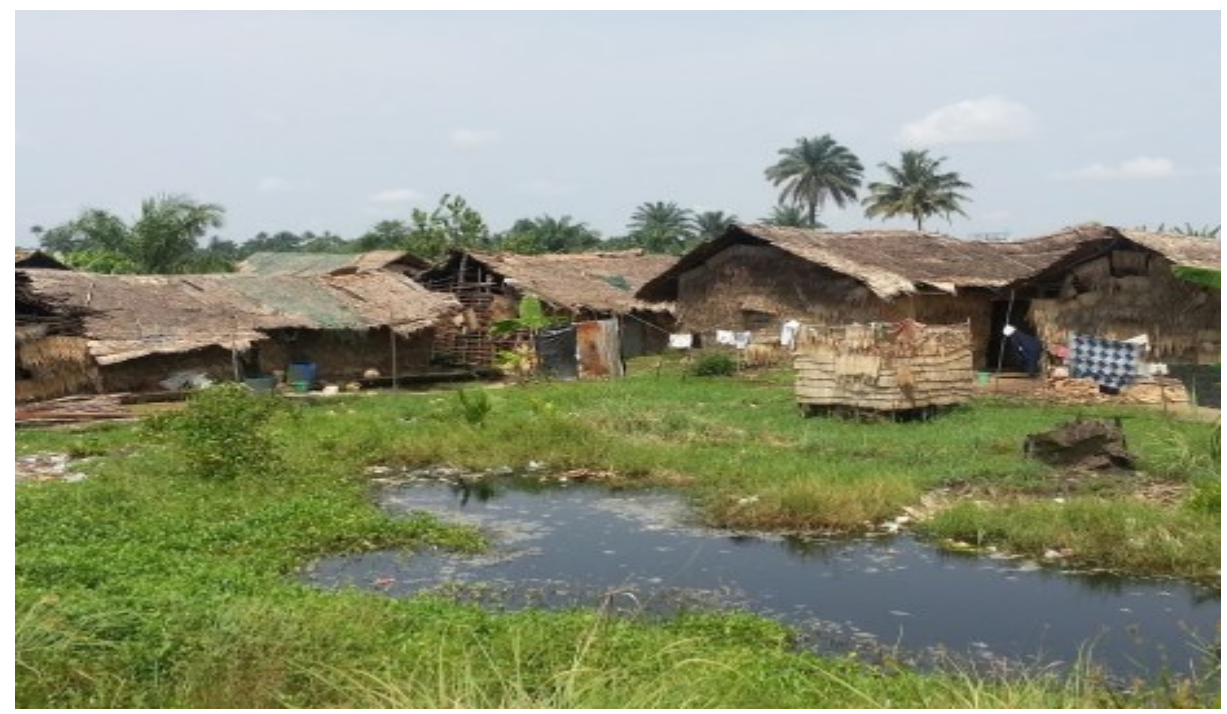
Figure 2 Ibeno Community in Akwa Ibom State

that is under lock and key because there is no teacher posted to the school. The people live in huts close to a polluted pond, which is their only source of water. The figure 2 below shows the situation.