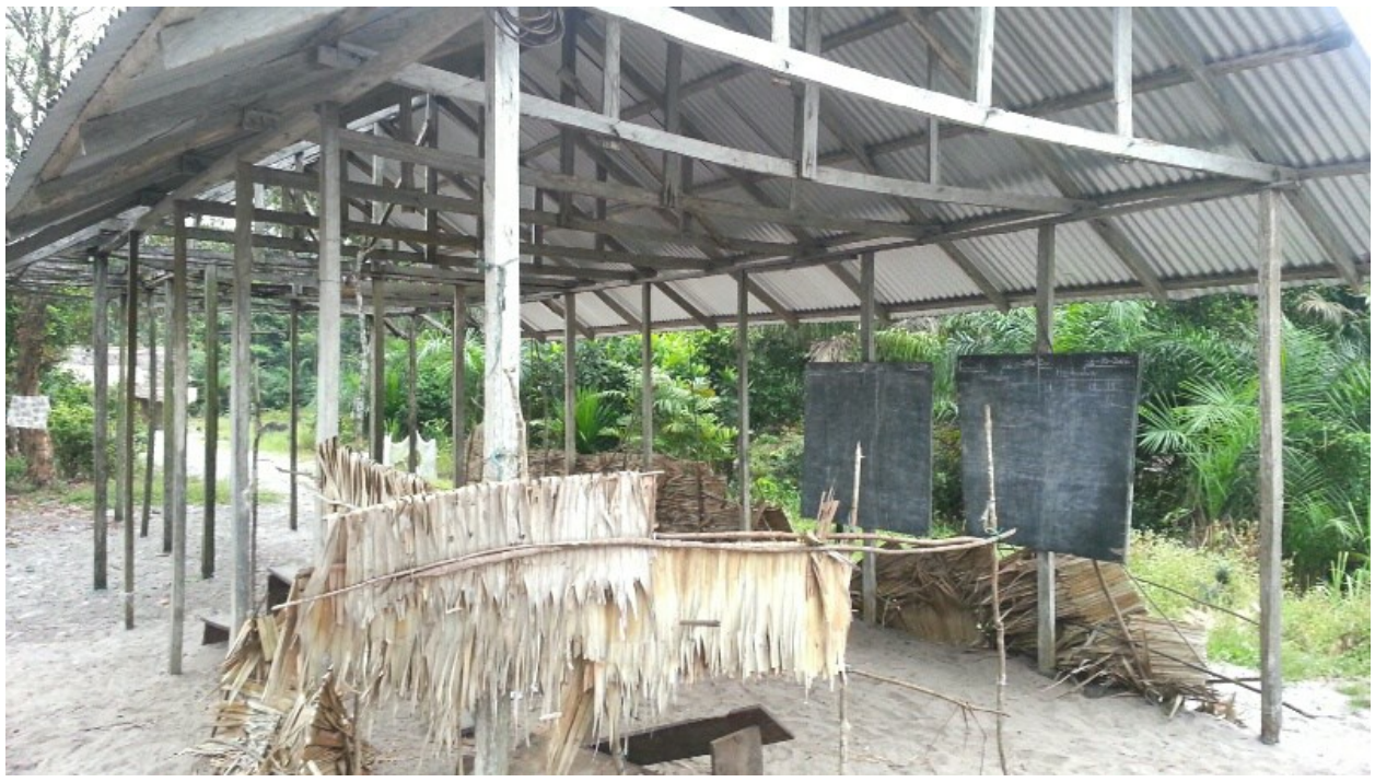
Figure 1: school in Niger Delta